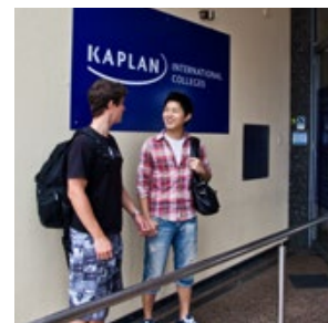
In front of the College