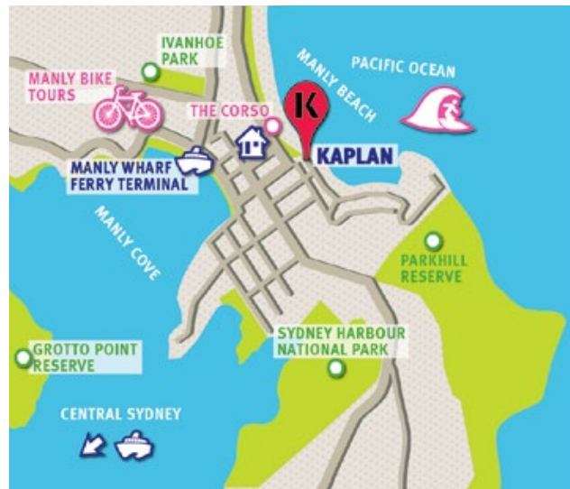
Kaplan International Sydney Manly 30-32 South Steyne Manly NSW 2095 Australia