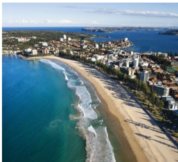
Manly Beach and Sydney City centre in the distance