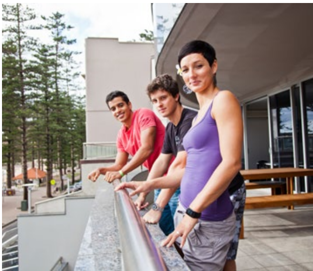
Kaplan International Sydney Manly

Other facilities include a multimedia library where students can access a variety of online and audio-visual resources, a spacious student lounge leading on to the large balcony and of course step outside the door and you are on the beach!