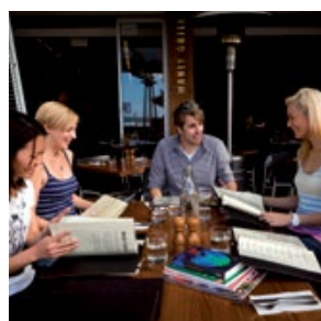
Cafés and restaurants